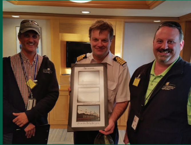
The Port honors MV Diana Bolton on its first call at the Bellingham Shipping Terminal

Special thanks to these regional business partners for their ongoing support: